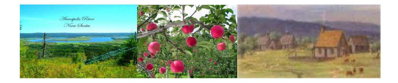
Day 8, Saturday, 17<sup>th</sup>